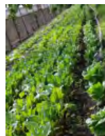
One of the many things that I like about