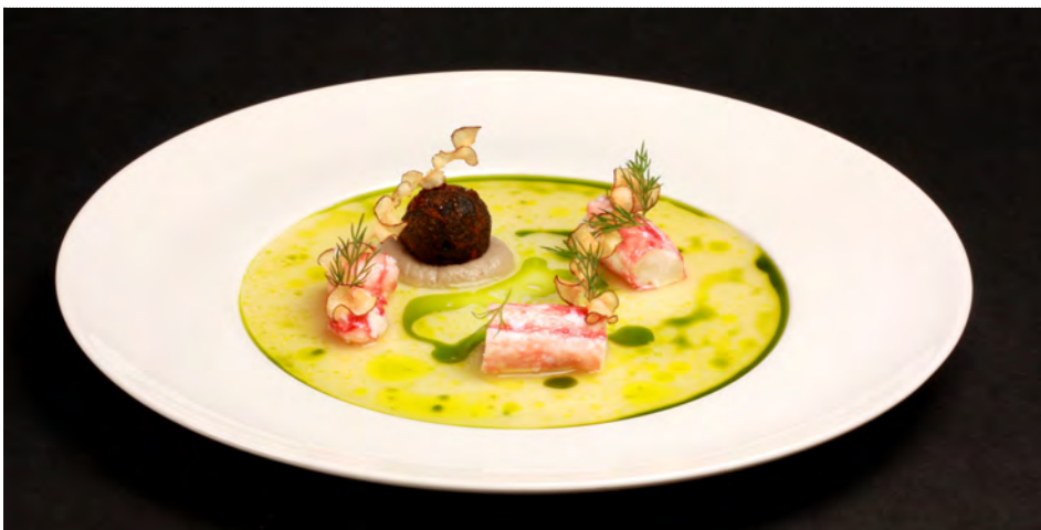
Alaskan king crab with Seville orange water, sour berry herb croquette and sunchokes

March 14, 2012, 4:44 pm • Section: Food, Signature Dish